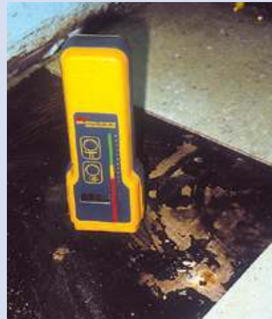
Photo 9: Moisture meter measuring moisture content of plywood subfloor