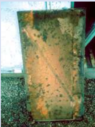
Photo 4A: Contaminated fibrous insulation inside air handler cover

Do not run the HVAC system if you know or suspect that it is contaminated with mold. If you suspect that it may be contaminated (it is part of an identified moisture problem, for instance, or there is mold growth near the intake to the system), consult EPA's guide Should You Have the Air Ducts in Your Home Cleaned? 4 before taking further action (see Resources List).