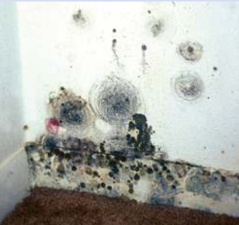
Photo 3A: Mold growing in closet as a result of condensation from room air