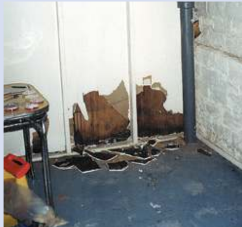
Photo 3B: Front side of wallboard looks fine, but the back side is covered with mold